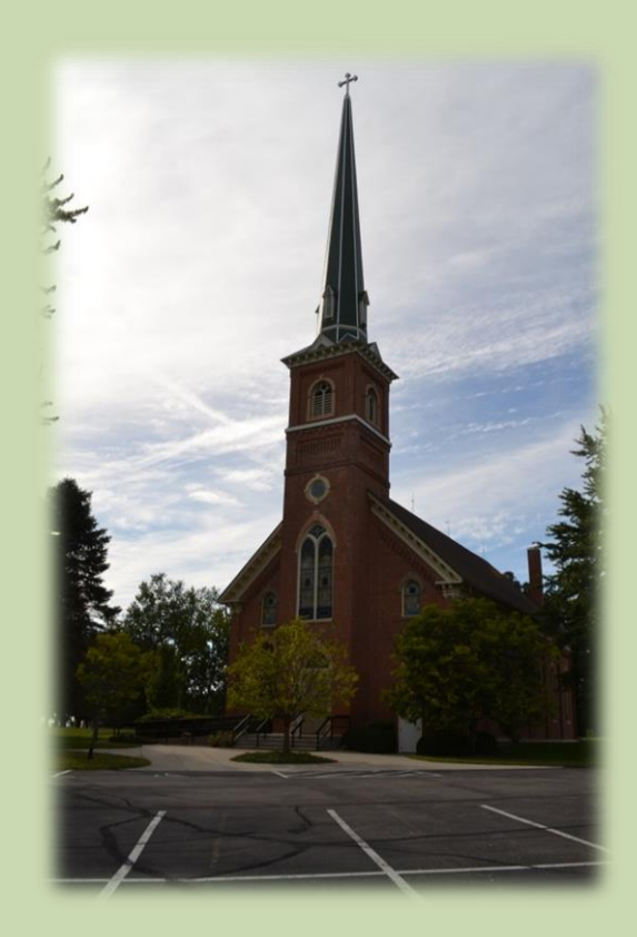
St. Brendan's Church

The City is home to different houses of worship for different people in the community, including St Brendan's Catholic Church and St Paul's Lutheran Church where people congregate in share of faith and prayer.