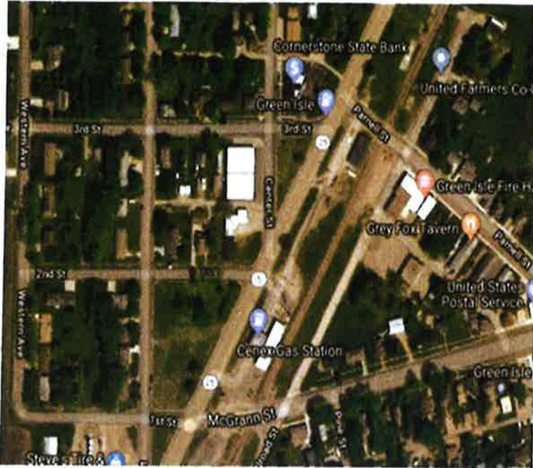
Aerial View of the City

...Beautiful Community, a close distance to everything; shopping, restaurants and more! You have to check out the wonderful baseball field in town!