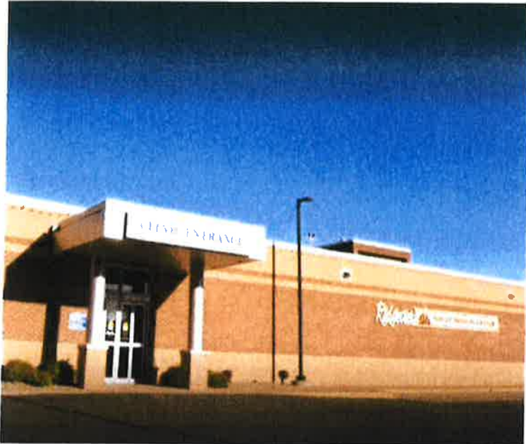
The Ridgeview Sibley Medical Center

Green Isle is 6 miles away from the Ridgeview Sibley Medical Center, which is dedicated to providing health care services of outstanding quality, caring for patients and improving the health of individuals served.