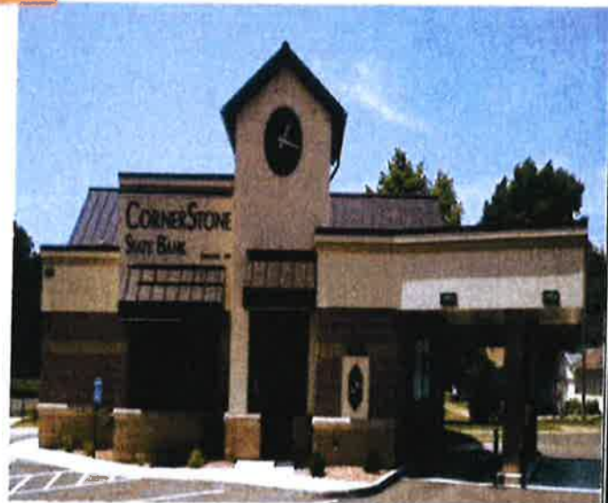
Cornerstone State Bank

The City combines many essential functions and services with the city of Arlington namely; water treatment and waste water services. Police protection is provided by the Sibley County Sheriff's Department. These types of relationships have proven to be very cost effective