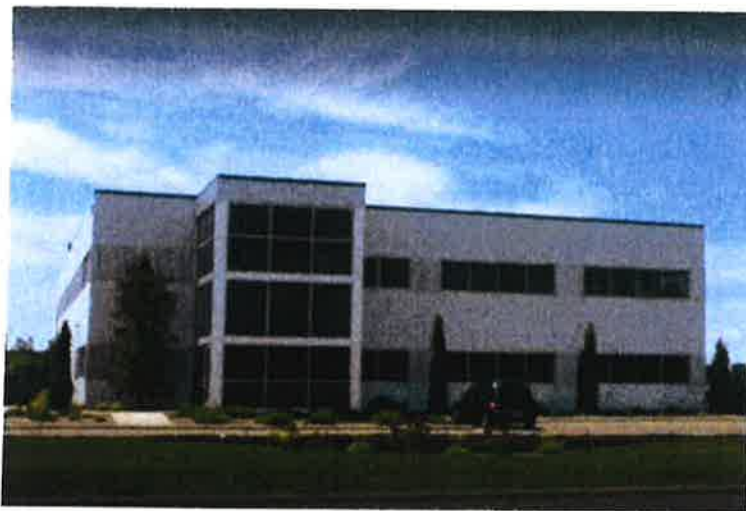
JIT Company, Shamrock Drive, Green Isle