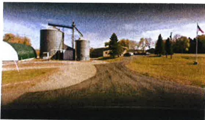
Vos Construction Inc.

'...little has changed since the first time I used Vos Construction Inc. back in the 80's, when I found the company to be honest, punctual, pleasant, while providing outstanding workmanship with the utmost of integrity...'