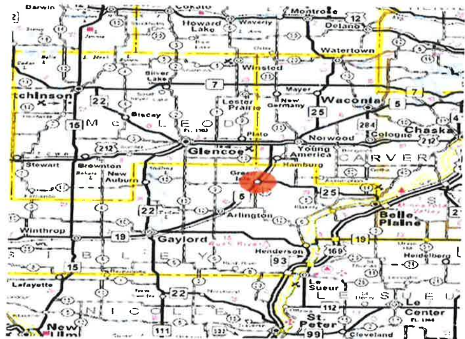
A map of Green Isle's Location

Green Isle is a progressive city and home to over 555 residents, with low costs of living and crime rates, and easy access to major highways. These aspects have been major contributions towards the growth of the city's housing sector, industrial park establishment and growth.