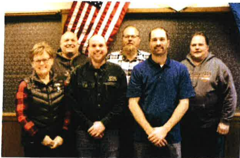
Photo: EDA 2018 members