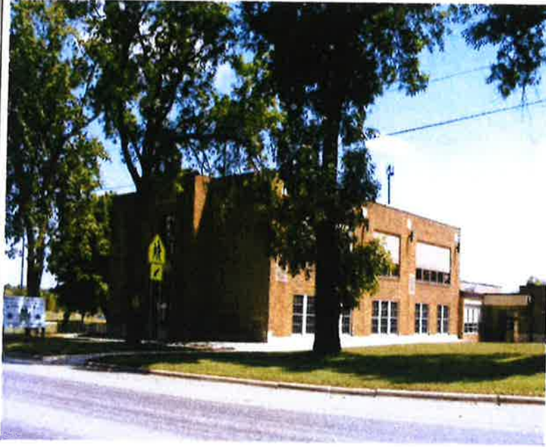
Green Isle Community School

...“There are wonderful learning opportunities at the Green Isle Community School that all students can appreciate...”