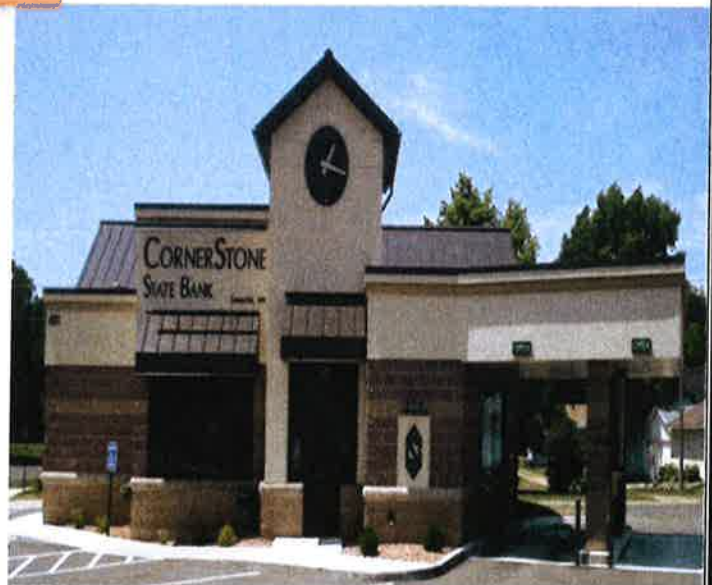
Cornerstone State Bank

The City combines many essential functions and services with the city of Arlington namely; water treatment and waste water services. Police protection is provided by the Sibley County Sheriff's Department. These types of relationships have proven to be very cost effective