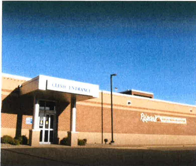
The Ridgeview Sibley Medical Center

Green Isle is 6 miles away from the Ridgeview Sibley Medical Center, which is dedicated to providing health care services of outstanding quality, caring for patients and improving the health of individuals served.