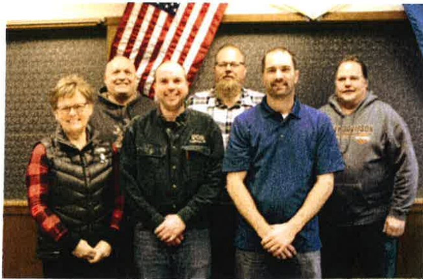
Photo: EDA 2018 members