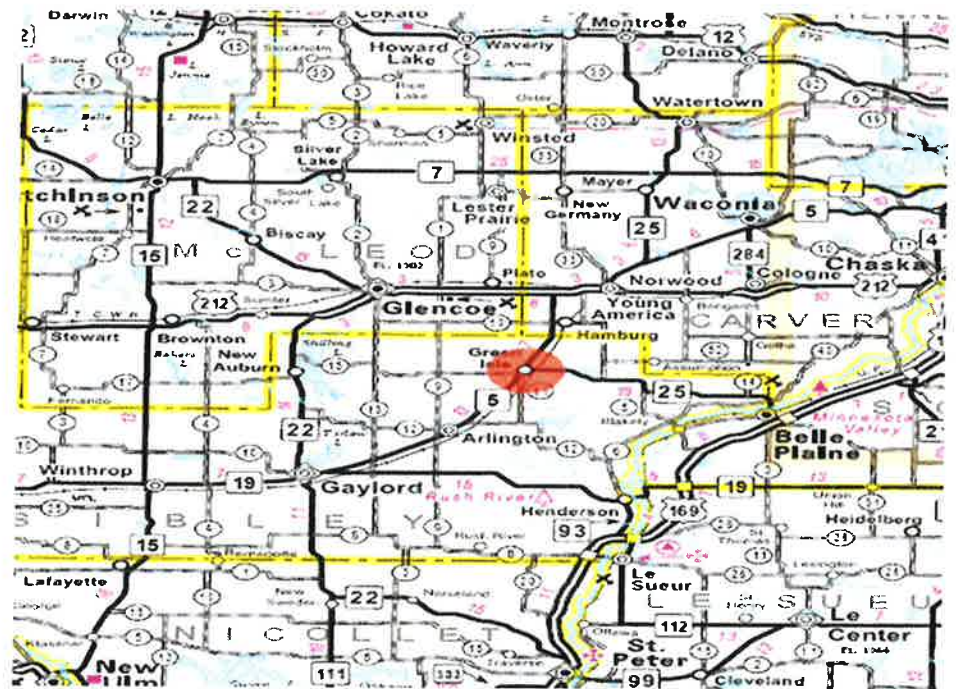
A map of Green Isle's Location

Green Isle is a progressive city and home to over 555 residents, with low costs of living and crime rates, and easy access to major highways. These aspects have been major contributions towards the growth of the city's housing sector, industrial park establishment and growth.