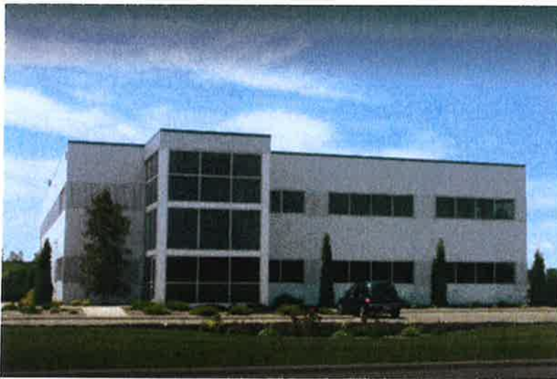
JIT Company, Shamrock Drive, Green Isle