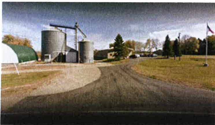
Vos Construction Inc.

'...little has changed since the first time I used Vos Construction Inc. back in the 80's, when I found the company to be honest, punctual, pleasant, while providing outstanding workmanship with the utmost of integrity...'