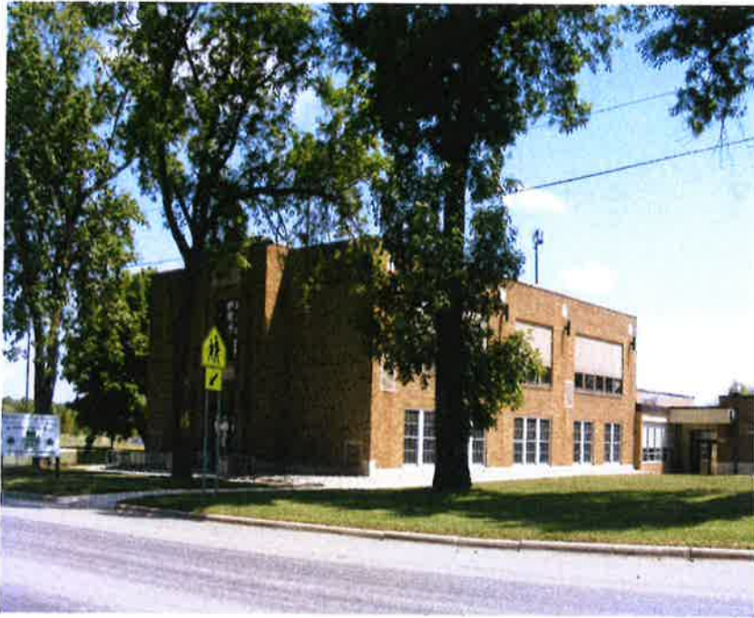
Green Isle Community School

...“There are wonderful learning opportunities at the Green Isle Community School that all students can appreciate...”